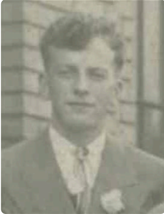
High school graduation